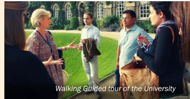
Walking Guided tour of the University