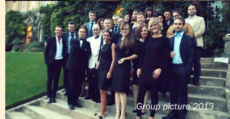
Group picture 2013