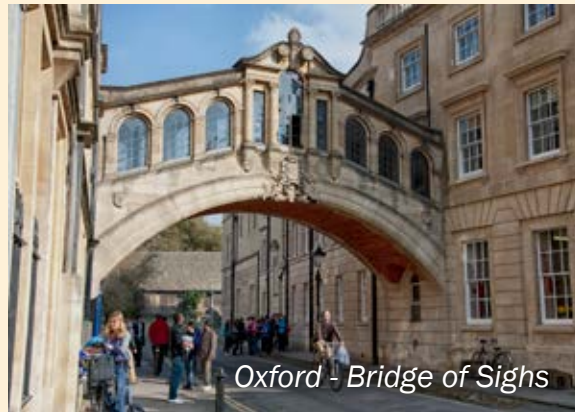
Oxford - Bridge of Sighs

The summer program will take place at Worcester College , one of the most beautiful and prestigious colleges in the University of Oxford. Founded in 1714, it is a happy blend of ancient and modern architecture. Its 26 acres of beautiful gardens and grounds provide a secluded environment, with lakeside walks and a large sports ground.