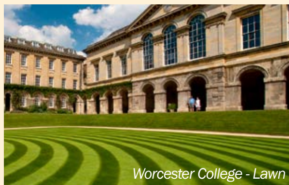
Worcester College - Lawn

You are invited to join an intensive 6-day learning experience designed to enhance your English communication skills and give you greater confidence in dealing with foreign companies, colleagues and clients.