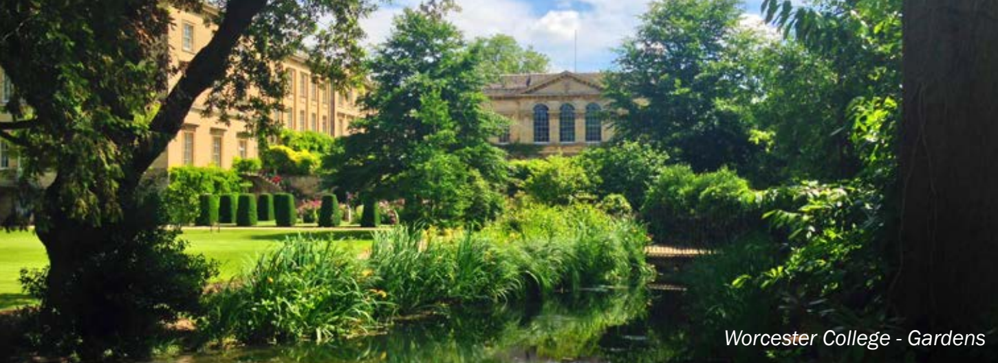
Worcester College - Gardens